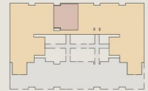
SAFARI II - LEVEL 5

ROYAL SHORES DISPLAY CENTRE 1 Bundarra Street, Ermington NSW 2115 P 1300 888 558 W royalshores.com.au