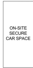
ON-SITE SECURE CAR SPACE

542B/6 COWPER WHARF ROADWAY WOOLLOOMOOLOO