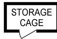
LEVEL ONE NO.602

APPROX. INT. AREA : 80m 2 APPROX. EXT. AREA : 13m 2 TOTAL AREA INCLUDING CAR SPACE AND STORAGE CAGE : 108m 2