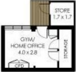
STUDIO PLAN (BELOW CARPORT)