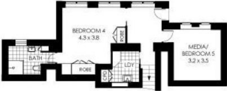
LOWER GROUND FLOOR PLAN