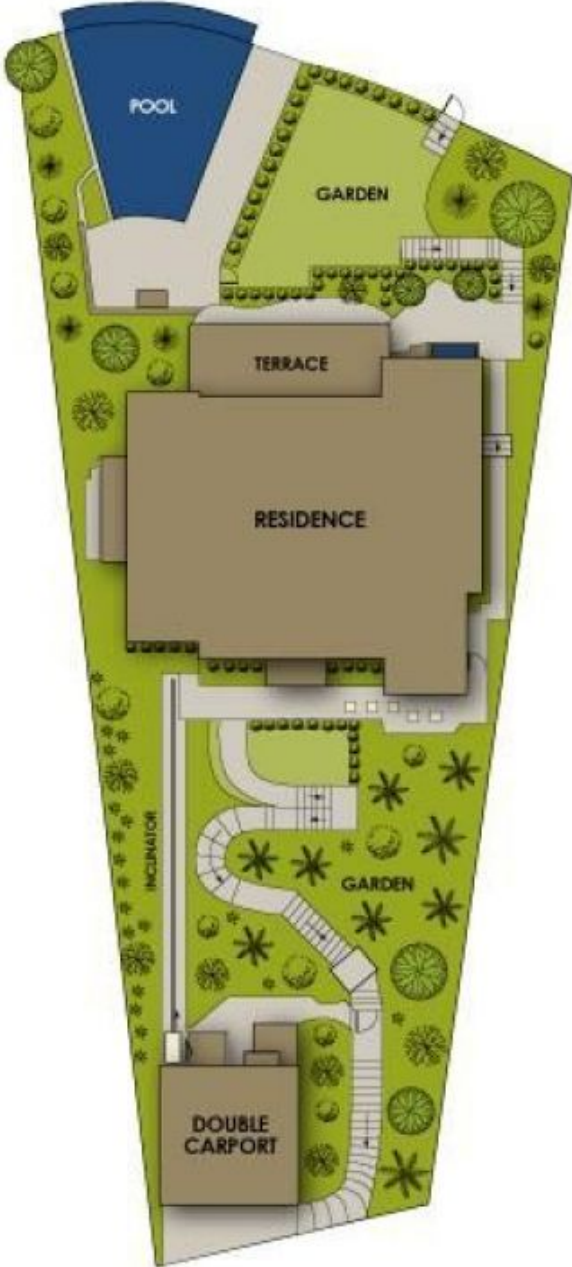
THE BULWARK SITE PLAN