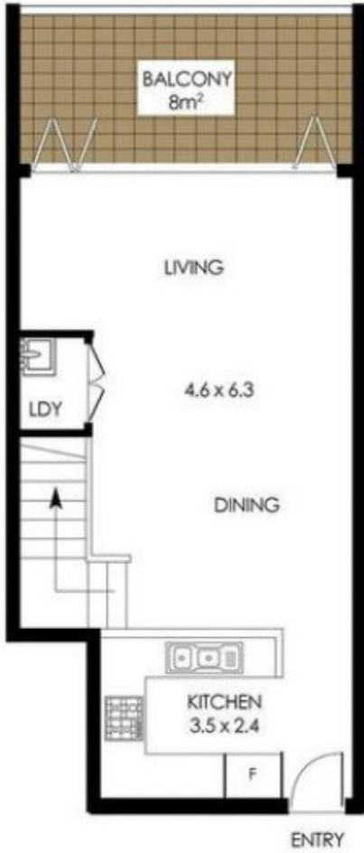
ENTRY LEVEL FLOOR PLAN