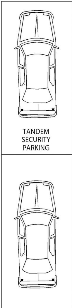
TANDEM SECURITY PARKING