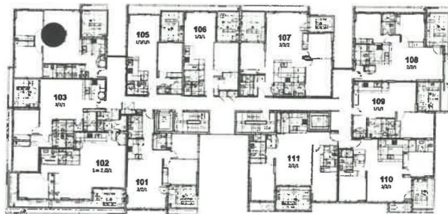
MARKHAM AVENUE LEVEL 1