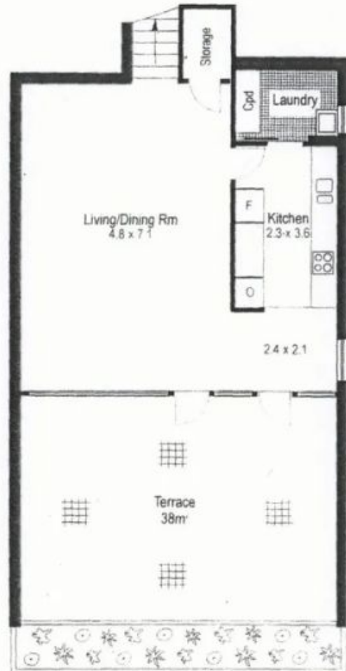
LOWER LEVEL FLOOR PLAN