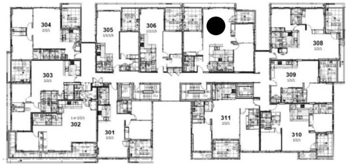
MARKHAM AVENUE LEVEL 3