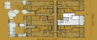
LEVEL 1 FLOORPLATE SHOWN