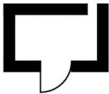
STORAGE CAGE NO 506 LEVEL B2