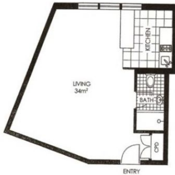
APARTMENT FLOOR PLAN