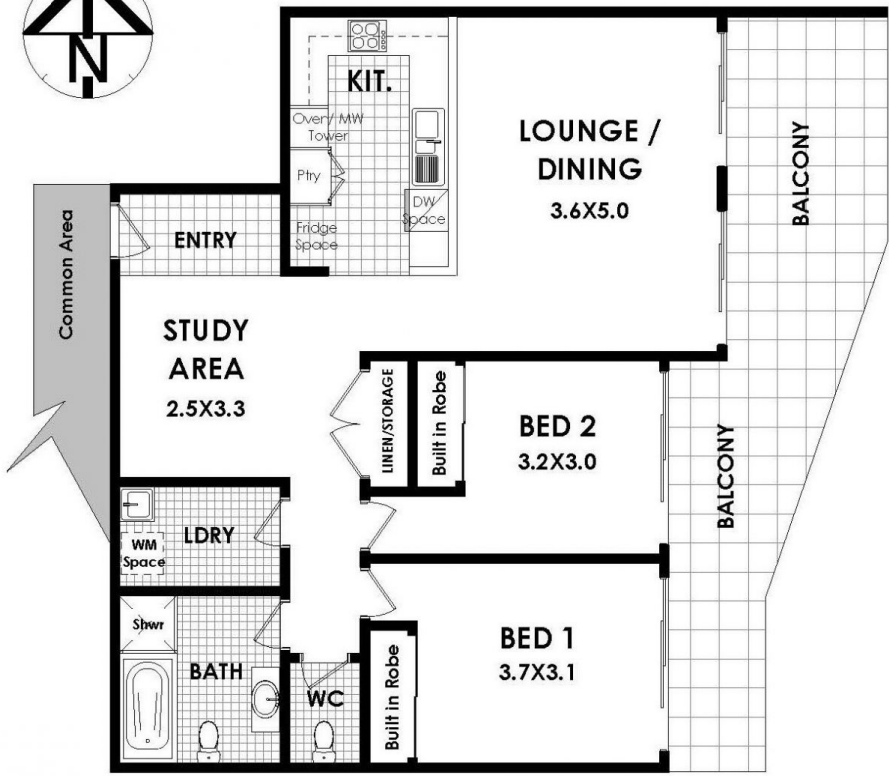
Floor Plan (Not to Scale)