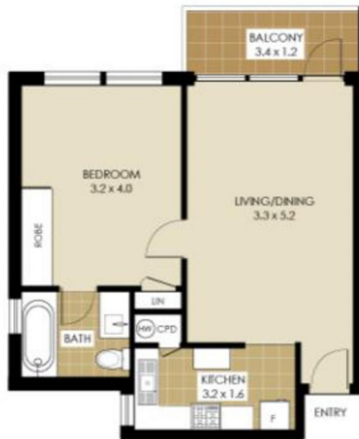
APARTMENT FLOOR PLAN