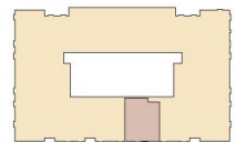
SIRIUS - LEVEL 3