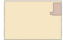
SAFARI I - LEVEL 1