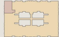
SIROCCO II - LEVEL 4

ROYAL SHORES DISPLAY CENTRE 1 Bundarra Street, Ermington NSW 2115 P 1300 888 558 W royalshores.com.au