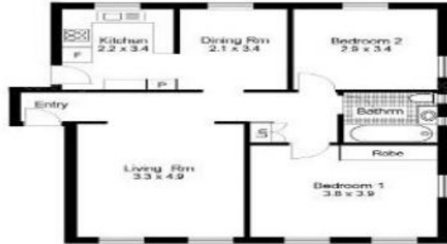
APARTMENT FLOOR PLAN