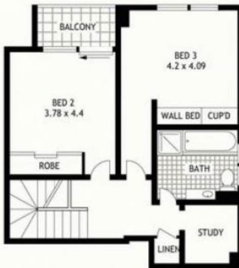
TWENTY SIXTH FLOOR