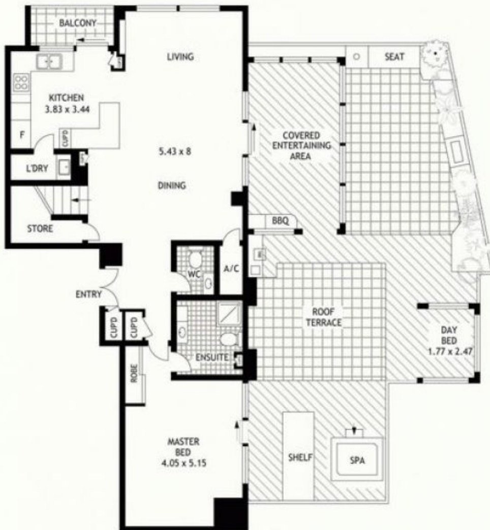
TWENTY FIFTH FLOOR