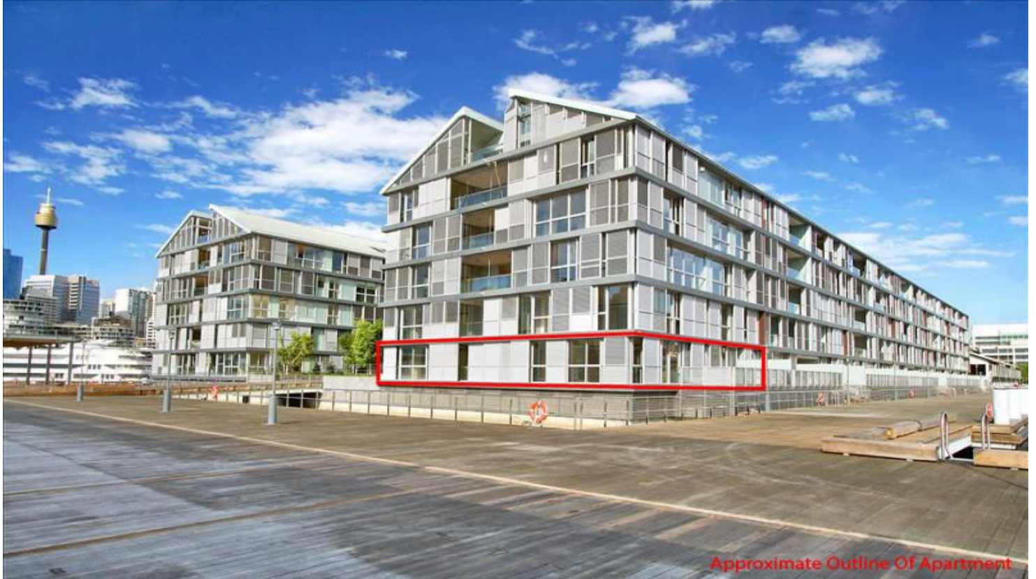
Approximate Outline Of Apartment