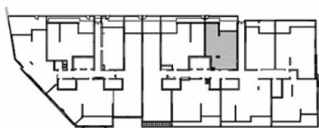
Keyplan Level 1