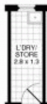
L'DRY/ STORE 2.8 x 1.3