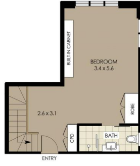
LEVEL 2 FLOOR PLAN