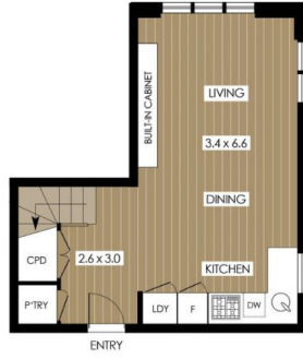
LEVEL 1 FLOOR PLAN