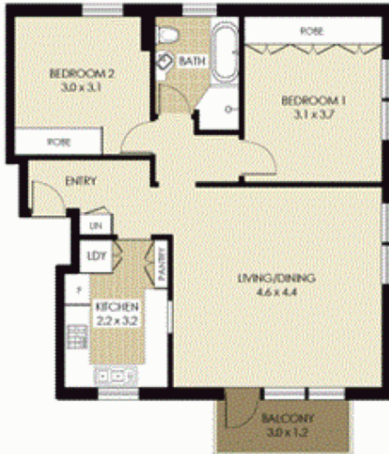
APARTMENT FLOOR PLAN