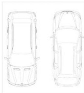
SECURE CAR PARKING 5.7m x 5.2m (NOT ACTUAL LOCATION)