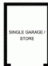
SINGLE GARAGE / STORE