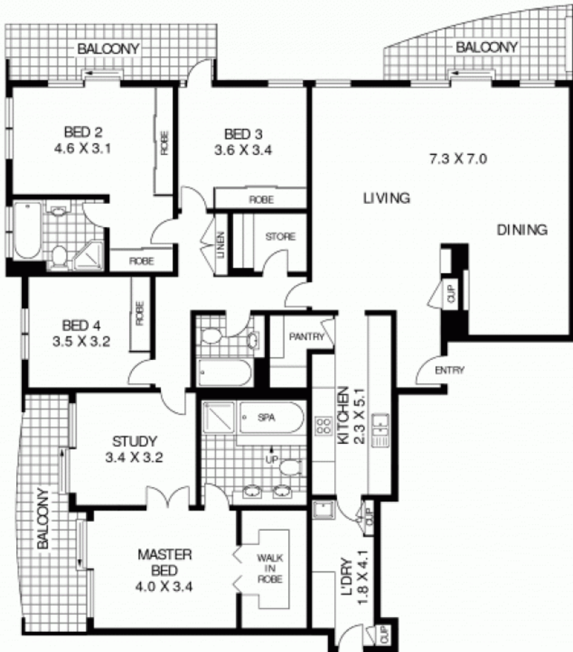
FOURTY FIFTH FLOOR