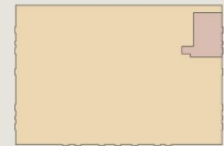
SAFARI I - LEVEL 1

ROYAL SHORES DISPLAY CENTRE 1 Burdarra Street, Ermington NSW 2115 P 1300 888 558 W royalshores.com.au