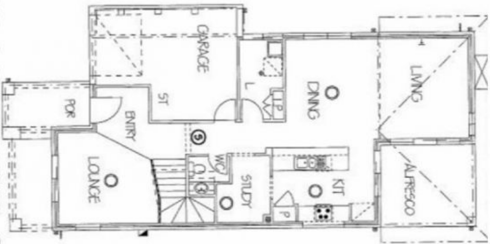
GROUND FLOOR ELECTRICAL PLAN 1:100