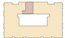
SEAMIST - LEVEL 3