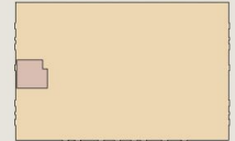
SAFARI II - LEVEL 1

ROYAL SHORES DISPLAY CENTRE 1 Burdarra Street, Ermington NSW 2115 P 1300 888 558 W royalshores.com.au