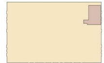
SAFARI II - LEVEL 1