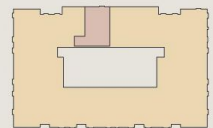
SAN MARCO - LEVEL 3

ROYAL SHORES DISPLAY CENTRE 1 Bundarra Street, Ermington NSW 2115 P 1300 888 558 W royalshores.com.au