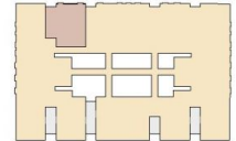
SIROCCO I - LEVEL 5