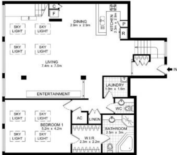
ENTRY FLOOR (LEVEL 4)