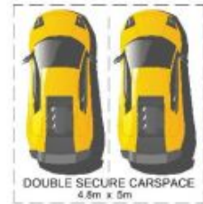
DOUBLE SECURE CARSPACE 4.8m x 5m