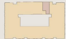
SAN MARCO - LEVEL 2

ROYAL SHORES DISPLAY CENTRE 1 Bundarra Street, Ermington NSW 2115 P 1300 888 558 W royalshores.com.au